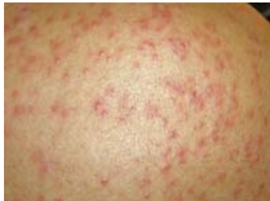
Figure 1 Cutaneous rash on the inner and outer arms, neck and thorax, with vesicles from 2 to 4 mm

In that clinic the person got oxygen again, as well as bronchodilators and antihistamines. The subject stayed in the hospital for seven days, in the internal medicine service, where he was constantly under the same treatment. During the hospital stay he expelled