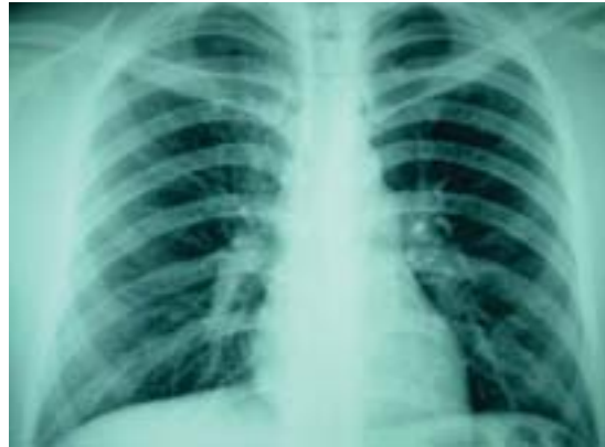
Figure 3 Some opacities were detected rounded at 1/1 q/q (based on the classification of 2000 of the International Labour Organization) in the X-rays of the chest taken 15 days after the accident

vesicles with diameter from 2 to 4 mm inside of the thorax, both arms, the sides foot, neck and face, as well as few pustules with 4 mm in diameter.