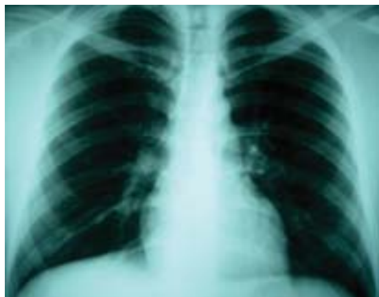
Figure 5 The thorax radiographic study was normal 50 days after the accident

this one dropped because of the edema in the blood-air barrier with consequent impairment of pulmonary reserve and diffusion time, which increases with supine position, showing signs of mild hypoxemia. The nonspecific irritation from massive exposure to cement caused acute rhinitis, bronchitis and alveolitis with a secondary edema. This could also impact on ventilation-perfusion index ( V_a/Q_c ) and, concomitantly, with respiratory failure.