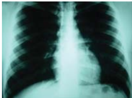
Figure 2 The periodical examination of X-rays was normal in the medical service

During the physical examination, the patient showed respiratory distress, with a heart rate of 32 beats per minute (bpm), bilateral basal crackles in anterior, lateral and posterior regions of the thorax, reinforcement of the second sound in pulmonary focus, abundant skin